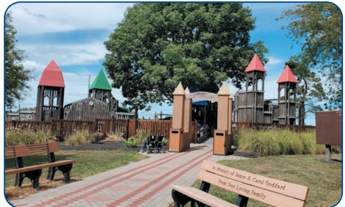
Golden Gate Park